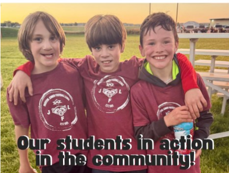
Our students in action in the community!