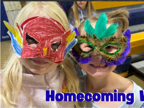
Homecoming Week Fun!