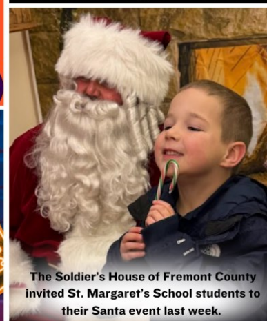
The Soldier's House of Fremont County invited St. Margaret's School students to their Santa event last week.

Church 620 E. Fremont Ave. Riverton, WY 82501 stmargchurch1@gmail.com Rectory - 307-856-6226